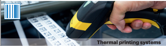
Thermal printing systems